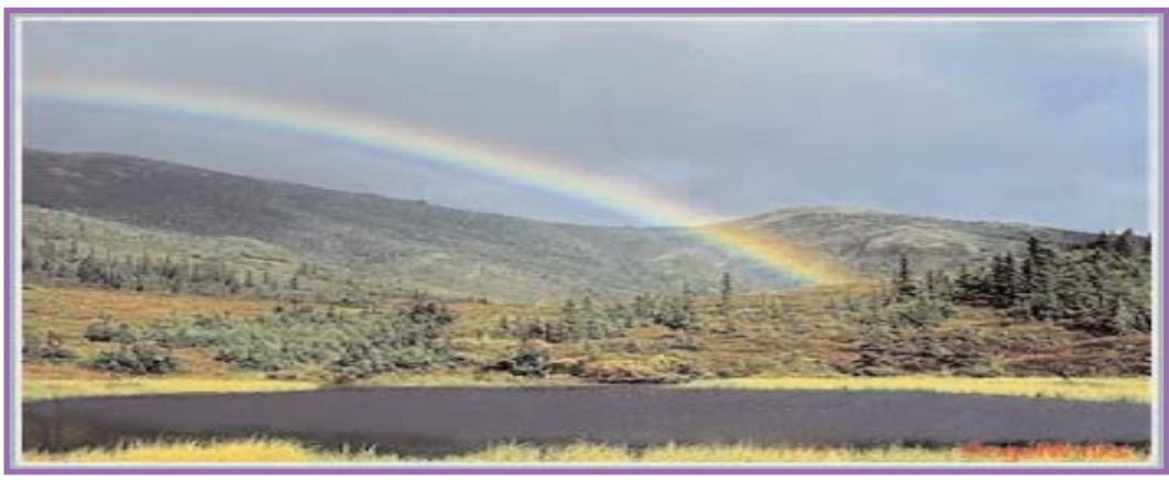
feel a sense of happiness and revitalization as we see the

Spring is a time for renewal of both the things in nature and within ourselves, our bodies